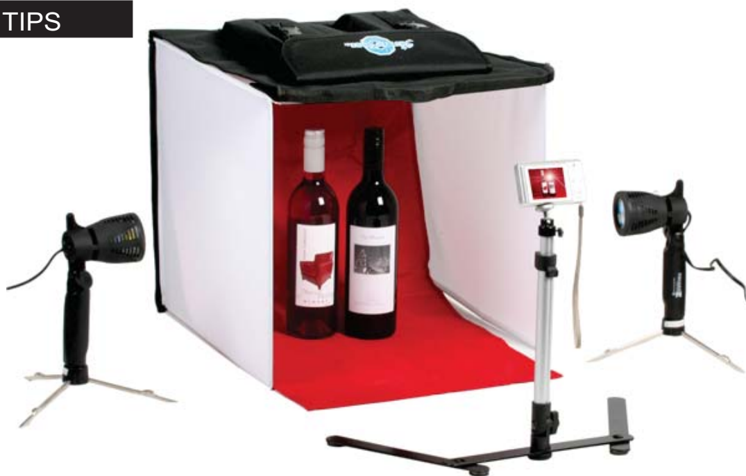
Photo Tent Camera Settings & Tips

Here are a few pointers that will help you to get the best photographs possible with your Shutter Starz Photo Tent.